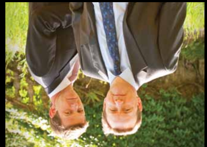
Stay in Midsomer and explore two trails